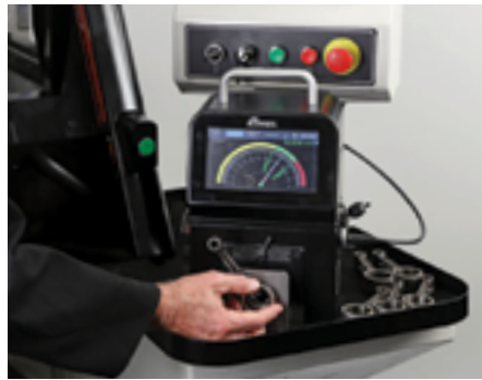
Radial Arc display.