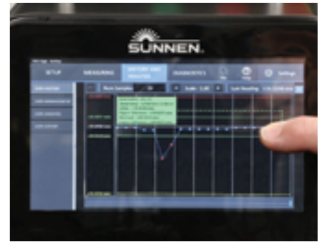
Easily view historic data.