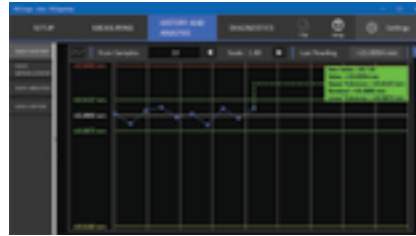
Data history mode.

A menu-driven operator interface allows the PGE-6000 user to select from a variety of screen displays depending on the application or the operator's preference, in both millimeters and inches. It also offers more capability and range of use with less hardware.