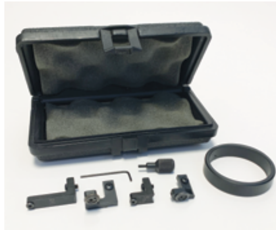
The optional PG-250E Extension Finger extends the range of the PGE-6000 from 38.10 mm to 74.30 mm (1.500" to 3.001 in.).